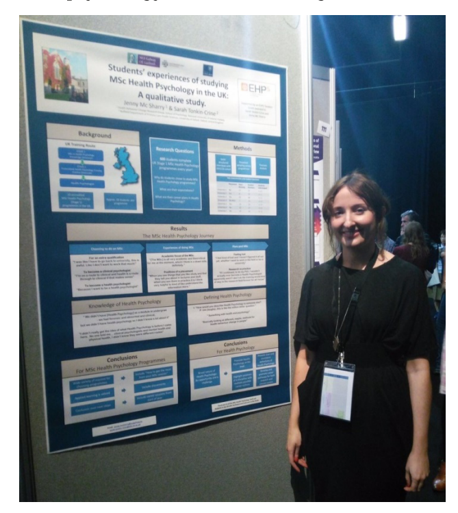
Poster presentation at EHPS Annual Conference in Aberdeen

results have helped us to consider our own teaching on MSc courses, for example through emphasizing the transferable skills being taught relevant to a range of careers and including careers sessions from early in the year to support interested students in pursuing careers in health psychology. Our findings also suggest ways to improve promotion of our discipline in general including highlighting the positives of a discipline with multiple possible career options and including health psychology content at undergraduate level.