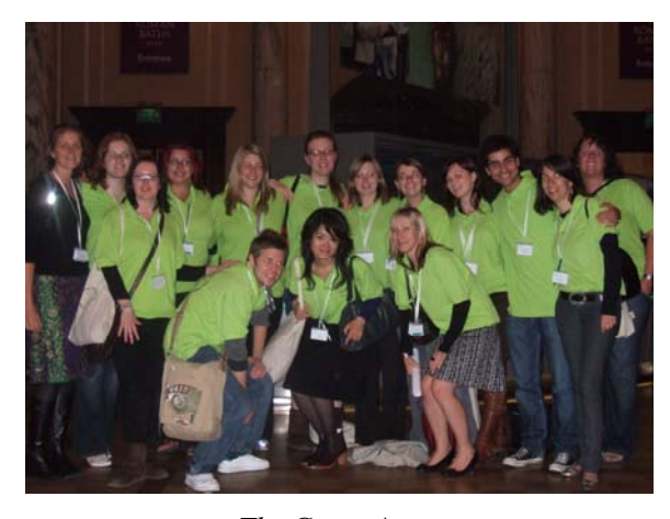
The Green Army

The general conference organisation was highly praised; in particular a positive aspect mentioned was the joint nature of the conference. This is the second joint conference between the British and European societies (the first was held at St Andrews in 2001). Delegates thought that bringing the two together made for a better quality and higher standard of conference and responders commented that they preferred the wider focus of the research. The organising committee and stewards (known as the 'Green Army' because of their distinctive t-shirts) were considered to be very helpful and attentive, and instrumental in creating a friendly environment within the conference.