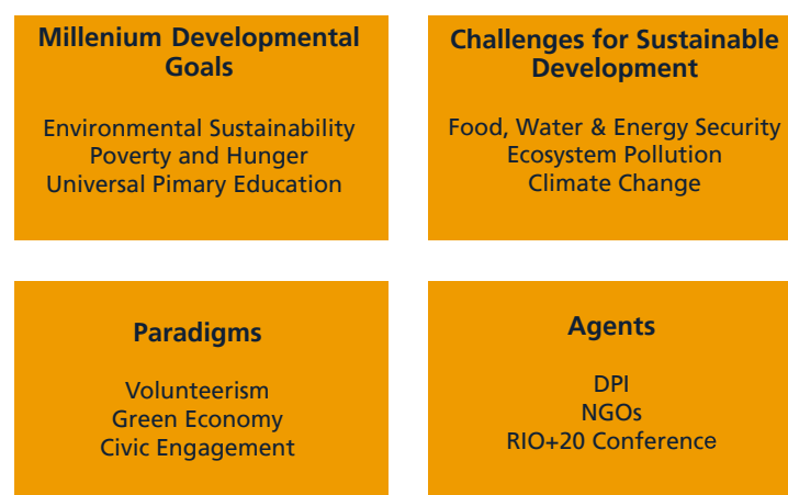
Figure 1. Categorized list of salient themes and principles

The second conclusion is the difference in the