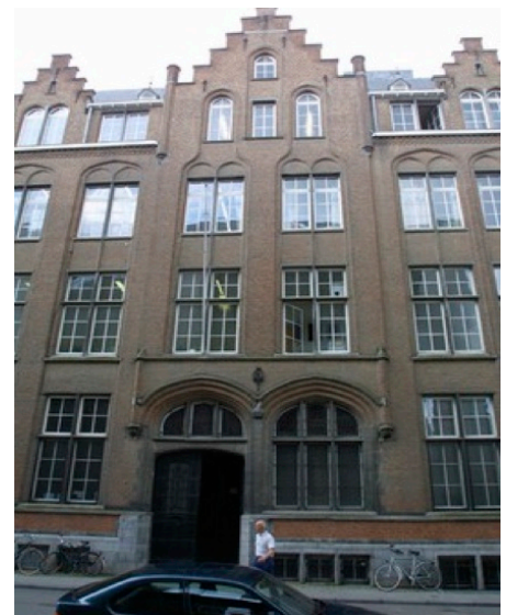
Faculty of Psychology and Educational Sciences, Katholieke Universiteit Leuven